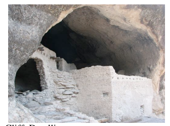
Cliff Dwelling Picture by Mike Nice – Gila Cliff Dwelling

In later years, the Mogollon also lived in cliff dwellings. They might have gotten this idea from their neighbors to the north, the Ancestral Puebloans (Anasazi). The Mogollon lived in cliff dwellings around 1270 - 1300 AD. The cliff dwelling contained rooms for living, food storage and ceremonies. Often many families lived together in these homes. Walls are built into natural caves to form rooms.